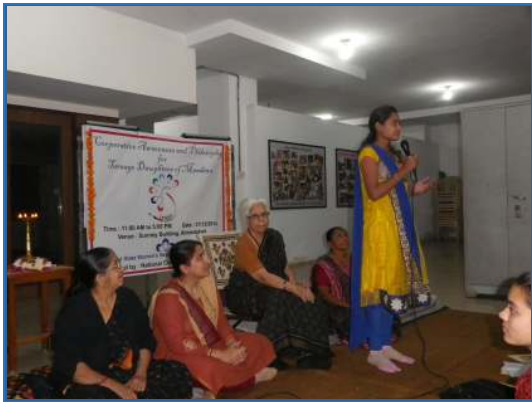
A young girl sharing her views during the seminar