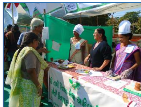
Members of Megha Cooperative offering their food to the customers

The Video Cooperative documented the activities of the cooperatives at the Satvik Fair.