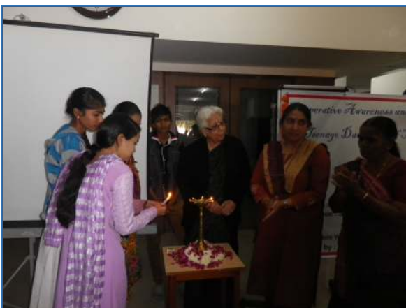
Inauguration of the seminar

National Insurance SEWA Cooperative received an award from NABARD (National Bank for Agriculture and Rural Development) and Xaviars' School of Management for Innovation for Impact in Financial Services. Vimo Sewa Cooperative is the first microfinance company for the women workers in informal sector.