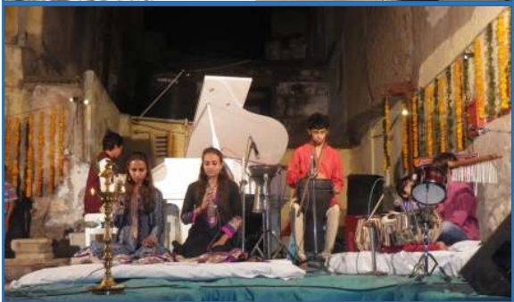
Musical event at Dhal Ni Pol