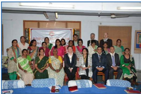
Labour minister of Canada visited SEWA's Cooperatives