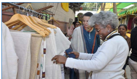
Ethiopian Ambassador to India checking the products in the stall

This is the outcome of the SETU-Africa program, supported by the Government of India, where Sewa Cooperative Federation is a partner.